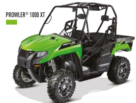
PROWLER® 1000 XT

The XT models come with a bigger motor (951cc), 272 kg / 600-lb. carrying capacity and a huge underhood storage space. Equipped with tough Surlyn® body panels and an HSLA steel frame, these Prowlers are ready to take you anywhere you want to go.