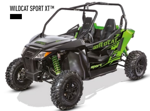
WILDCAT SPORT XT™

A low center of gravity and high power-to-weight ratio give you better acceleration, climbing ability and top end speed. The nitrogen-charged JRI ECX shocks will keep you comfortable and grounded all day as you rock with 13" of clearance on or off the trail.