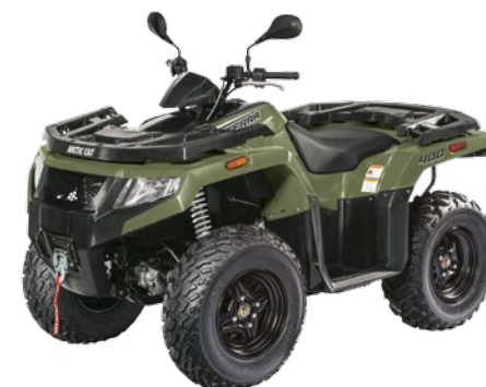
ALTERRA 400 4X4