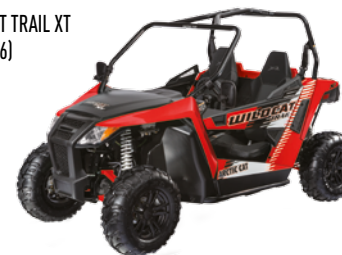
WILDCAT TRAIL XT (MY 2016)

With a 700 twin engine, compact powertrain design, 40/60 weight distribution and low center of gravity, this bad boy will take you to places unknown. And at only 50" wide, you can haul the Trail to narrow paths in the back of your truck.