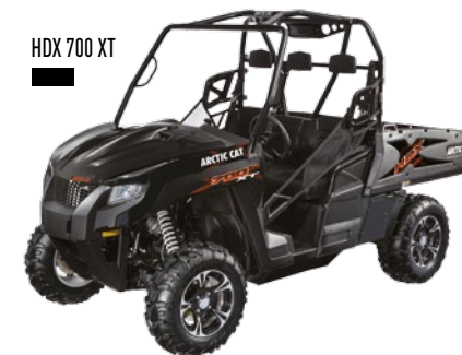
HDX 700 XT

The HDX™ is ready for whatever you toss its way and can haul it, too. The machines feature a two-in-one cargo box/flatbed that can carry up to 1,000 lbs. They also offer industry-leading enclosed storage space and FOX FLOAT® air adjustable rear shocks.